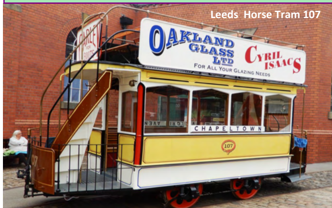
Leeds Horse Tram 107

The restoration of No.107 was paid for by the LTHS through fund raising and donations and further projects will be undertaken as opportunities arise.