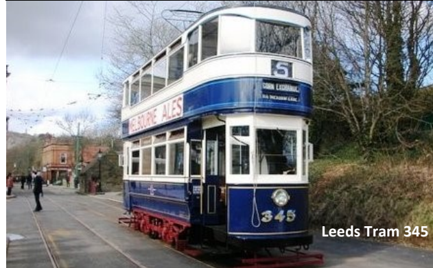
Leeds Tram 345

Yearly membership is currently £12.00. which is payable from 1 st September each year. As a Member you benefit with free attendance at our meetings, organised trips and discounts on LTHS produced books.