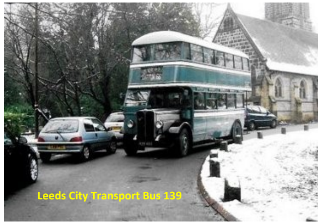
Leeds City Transport Bus 139

Gift Aid can only be obtained by the LTHS provided you pay tax to the UK Government and you have paid enough tax to cover the 25% of your membership / Donation.