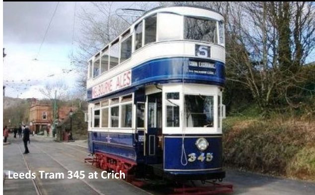
Leeds Tram 345 at Crich

Yearly membership is currently £12.00. which is payable from 1 st September each year. As a Member you benefit with free attendance at our meetings, organised trips and discounts on LTHS produced books.