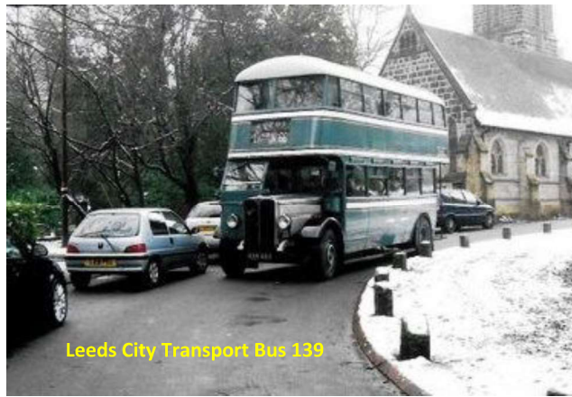
Leeds City Transport Bus 139

Gift Aid can only be obtained by the LTHS provided you pay tax to the UK Government and you have paid enough tax to cover the 20% of your membership / Donation.